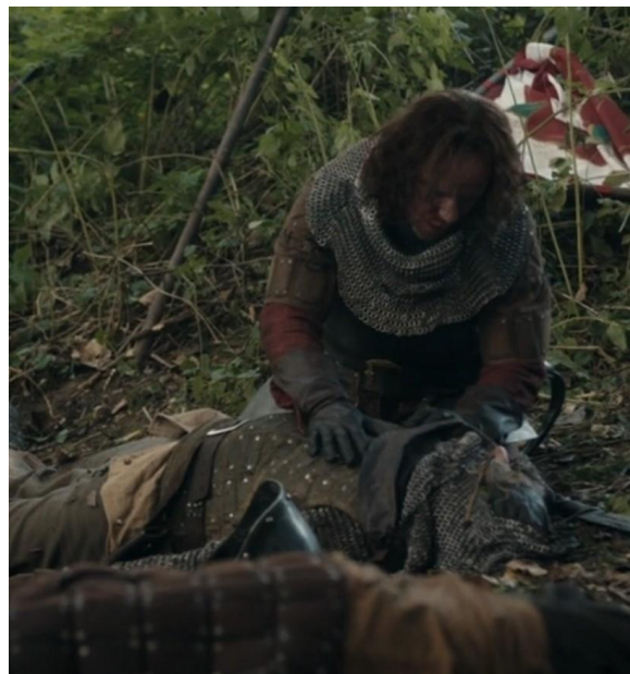
Figure 6: Lancastrian son leaning over his Yorkist father. Henry VI Part 2 (2016)