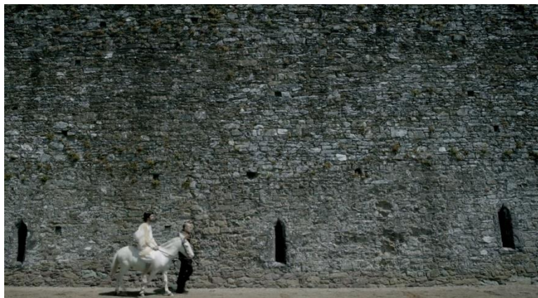
Figure 16: Richard II (Ben Wishaw) rides to his deposition in The Hollow Crown's Richard II .