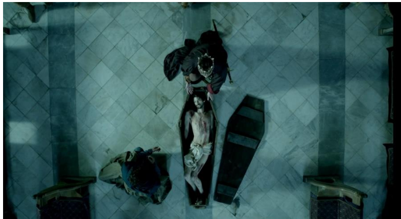
Figure 19: Richard II's (Ben Wishaw) body brought to Henry IV (Rory Kinnear) after his murder. BBC The Hollow Crown.

Richard resembles the crucified Christ. I contend the visual recalls the crucifixion rather than the entombment because of the emaciation, filth, and