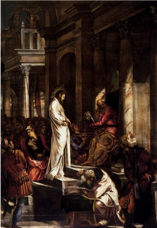
Figure 17: Jacopo Tintoretto's Christ Before Pilate (1519-1594)