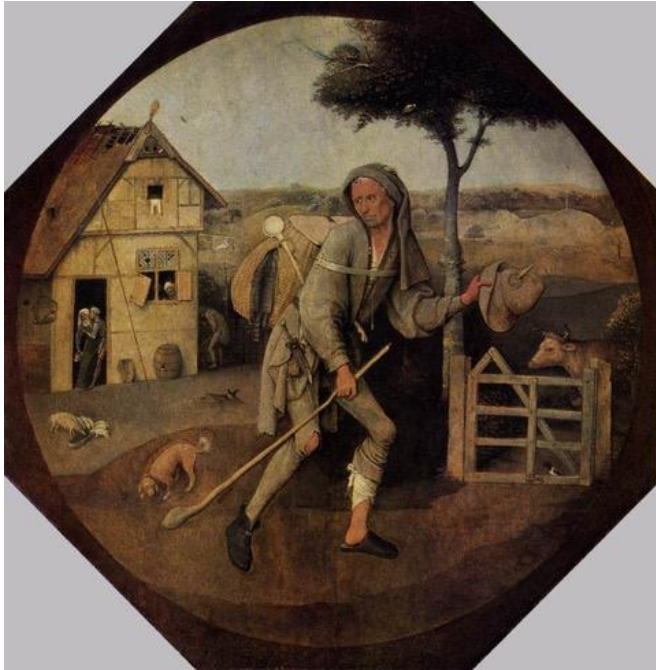
Figure 8: The Wayfarer (or The Pedlar) by Hieronymus Bosch, c. 1500