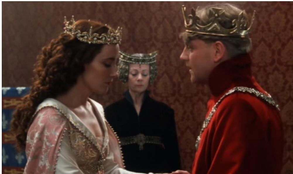
Figure 11: Katherine (Emma Thompson), Alice (Geraldine McEwan), Henry V (Kenneth Branagh) in Kenneth Branagh's 1989 Henry V.

reinforces the grittier style of Branagh's production, which still provides the visual spectacle, but is no longer