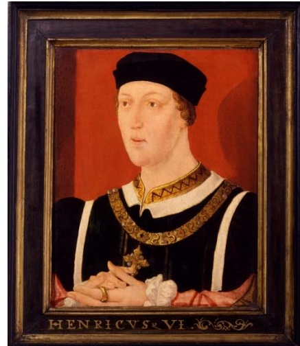
Figure 7: King Henry VI by Unknown Artist

On screen, Henry's costume communicates a distance between the role of the king and his true self. The costume participates in ego differentiation, made more prominent because of the tension in role distance. According to Sharon Lennon et al, ego differentiation is "the expression of a unique personality" through dress (187). Essentially, all dress provides communicative signals of personality expression. The modest, gray costume plays into this ego differentiation and it recalls Egerton's desire to give each character a unique style. However,