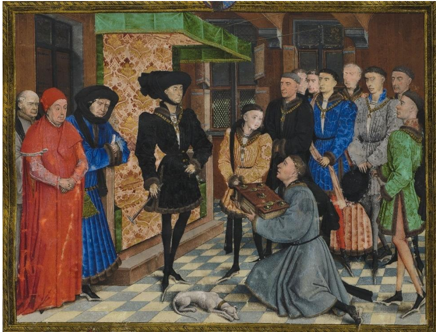
Figure 4: Rogier van der Weyden's 1447 Jean Wauquelin presenting his 'Chroniques de Hainaut' to Philip the Good

historical sources are a starting point for representation. The black, raven-like dress worn by Cumberbatch as a tall actor distinguishes Egerton's vision of Richard III as this cunning, long-legged bird, which shifts focus from Shakespeare's dominating descriptors of Richard.