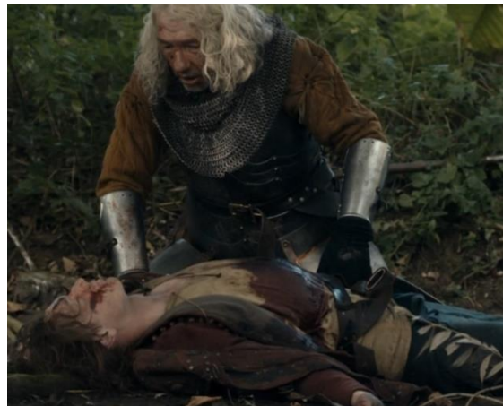
Figure 5: A Yorkist soldier leans over a Lancastrian man he's slain. Henry VI Part 2 (2016)