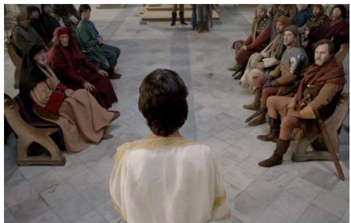
Figure 18: Richard II (Ben Wishaw) in the deposition scene of The Hollow Crown's Richard II.

within the scene, like figure 18, establish Richard's grace, like Tintoretto's painting. The presentation of the high angle shot behind Richard positions the viewer as a heavenly entity gazing down. In a similar move, the light in the Tintoretto painting suggests a divine presence within the image. Furthermore, Richard's visual appearance continues to reinforce his