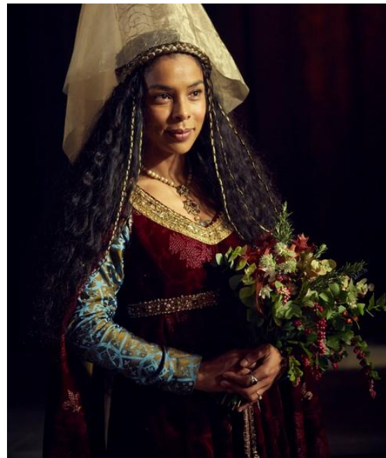
Figure 1: Margaret of Anjou (Sophie Okonedo) in Dominic Cooke's Henry VI (2016)

the visual of a production, while still allowing creative license in a production. Similarly, Shakespeare uses dialogue to describe Eleanor's costume, which points at how the changes in her station impact her appearance. First describing Eleanor, Margaret complains, "...the very train of her [Eleanor] worst wearing gown / Was better worth than all my father's lands. . . ." (1.3.101 2H6 ). Essentially, Eleanor cultivates an identity that is above her station as "Strangers in court do take her for the Queen" (1.3.80 2H6 ). The suggestion that Eleanor's costume be extravagant beyond even Margaret as queen emphasizes Eleanor's ambition for her husband, Gloucester, to be king. Eleanor dressing above her social position causes a chain reaction in the narrative. Essentially, Eleanor's costume adds to the doubt surrounding Gloucester's motives in holding onto his position as Lord Protector while Henry VI is capable of ruling. The costume needs to draw Margaret's attention and ire to Eleanor as a potential threat, which motivates setting a trap to catch Eleanor plotting against Henry. In turn, Gloucester's image is damaged by association to Eleanor. Thus, Shakespeare's inclusion of costume is strategic even when not explicitly detailed.