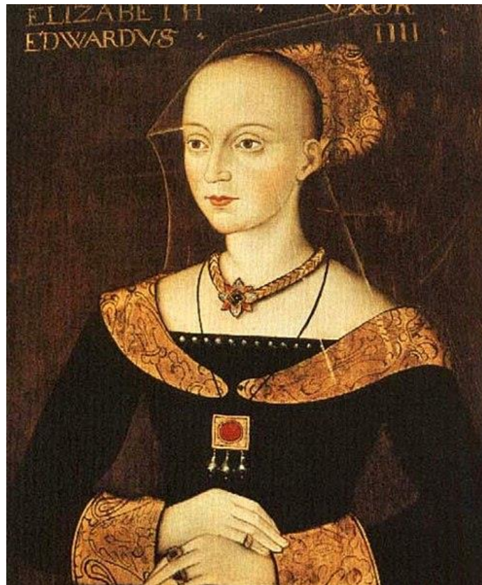
Figure 3: Painting of Elizabeth Woodville used as a reference image for Queen Elizabeth for The Hollow Crown. Artist unknown, circa 1471.