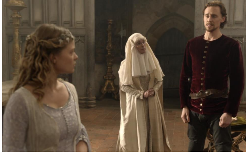
Figure 12: Katherine (Mélanie Thierry), Alice (Geraldine Chaplin), Henry V (Tom Hiddleston) in Thea Sharrock's 2012 Henry V .

Across the screen adaptations of Henry V , the wooing scenes' costumes change as each adaptation is overwritten and another imitation emerges to reinterpret the hypotext and the palimpsest of screen