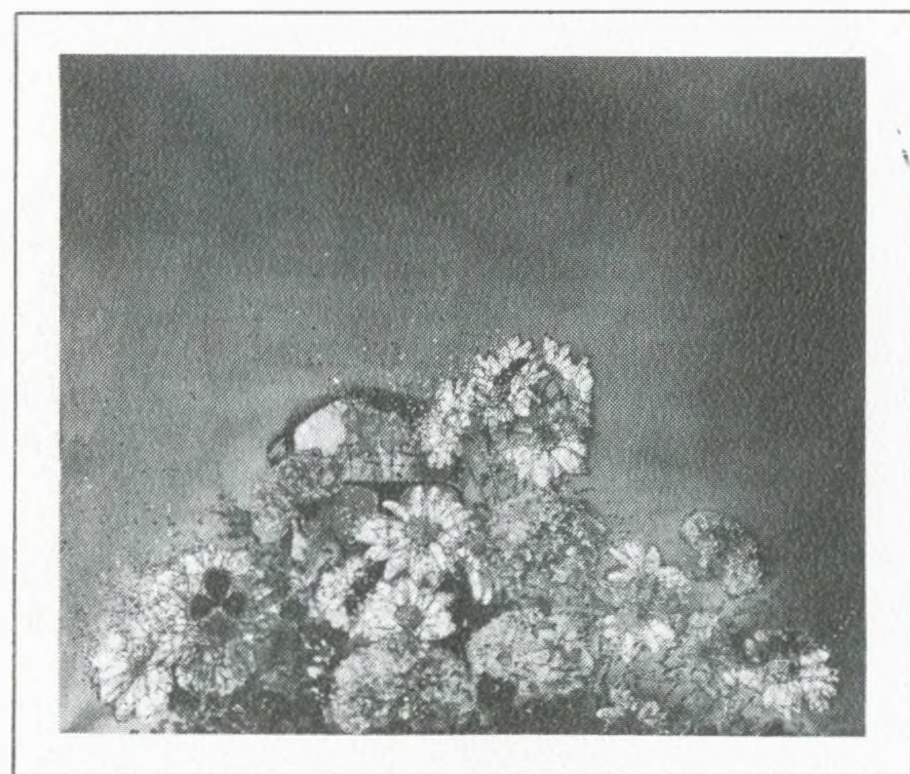
Seeking Cover 46 x 48