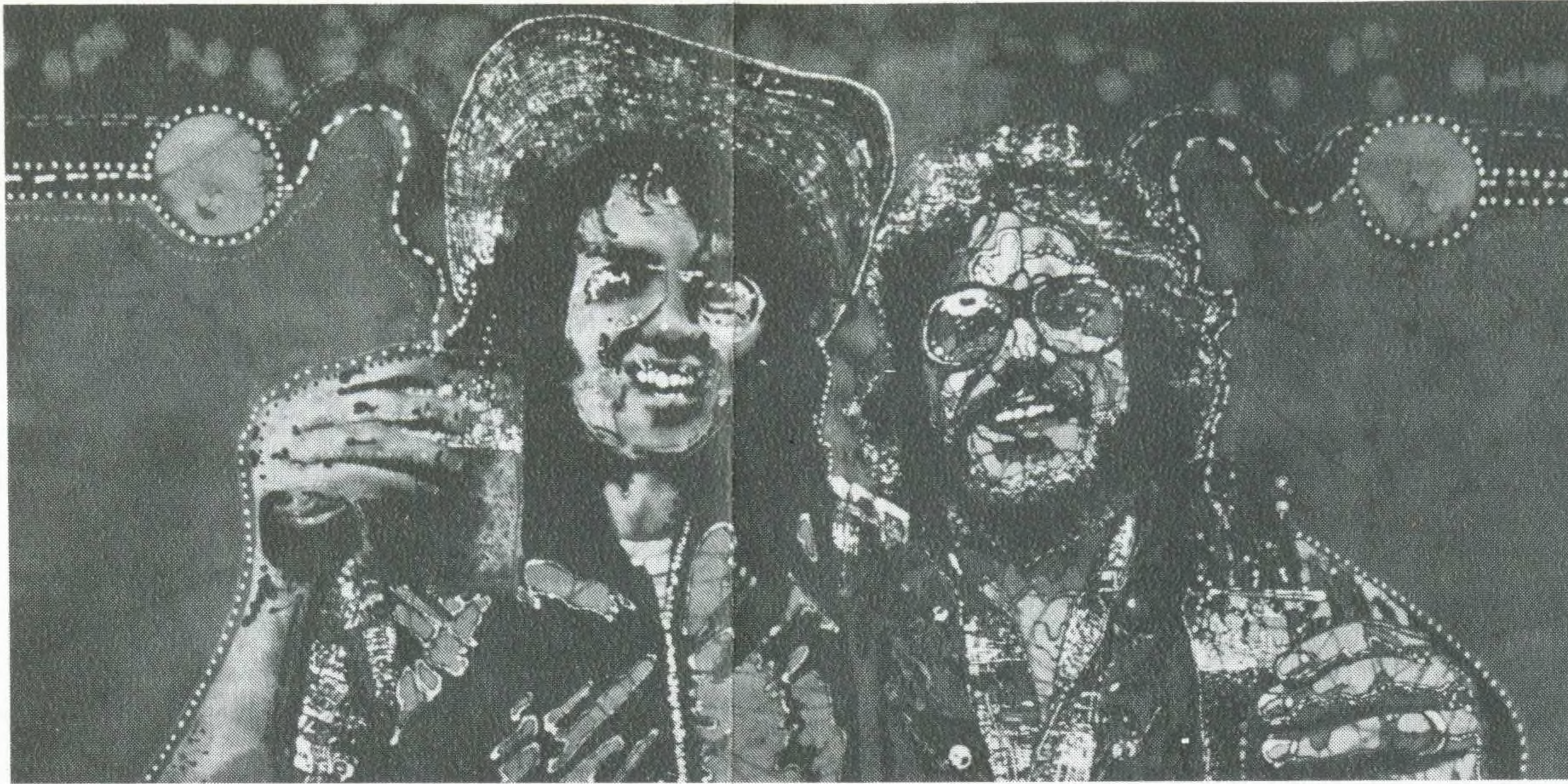
Happy Harry Drinks with Bop the Space Cowboy 28 x 44