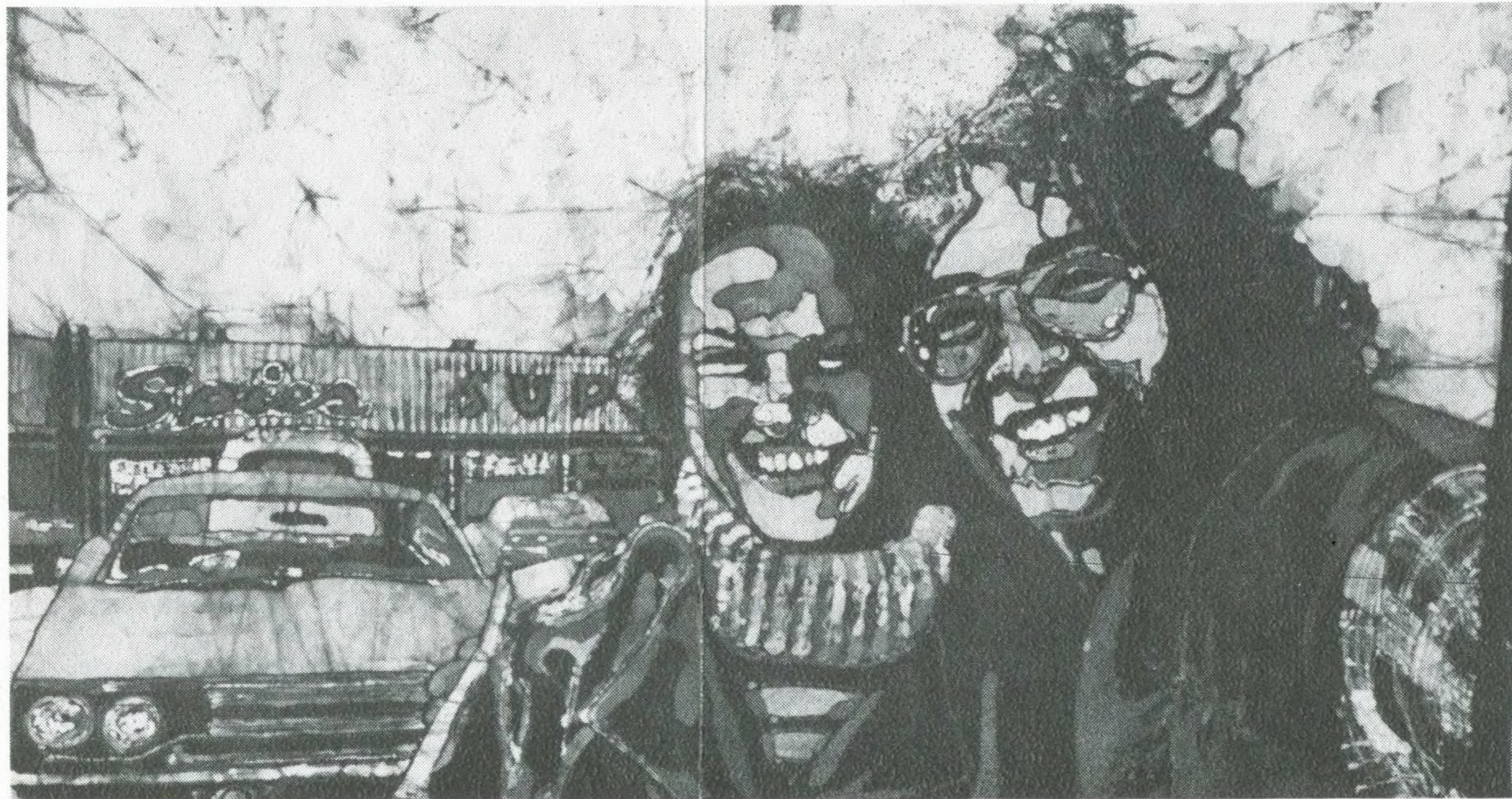
Me & Vic 25 x 36