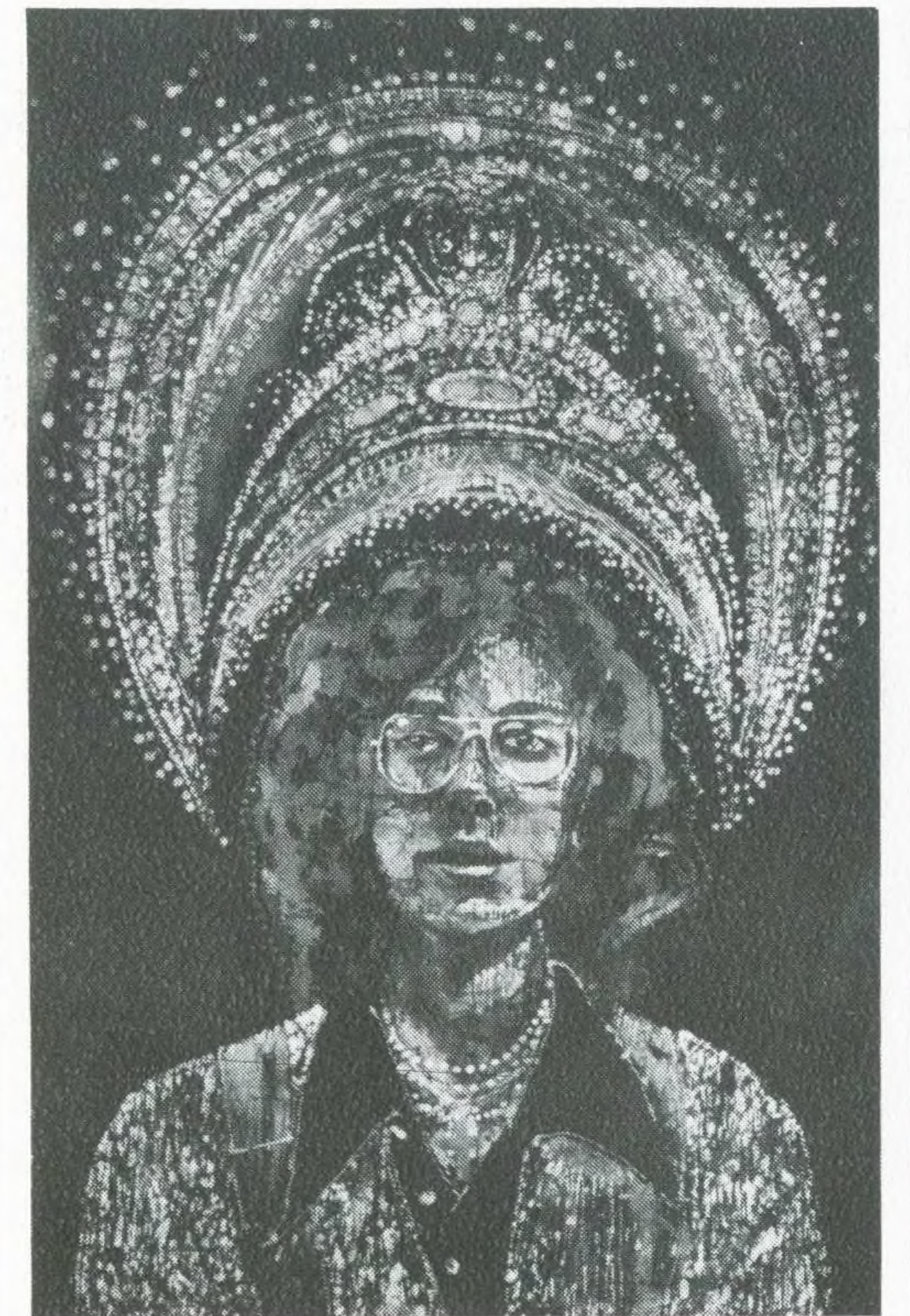
On Your Knees, Jack (Detail) 46 x 86