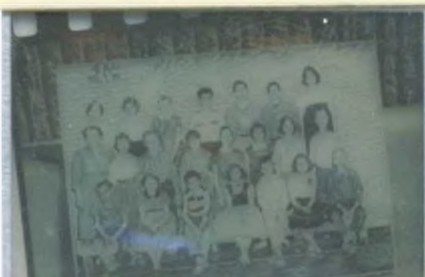
Matz, R.A. 1976 3 Structured Learning Drawing 18"x70"