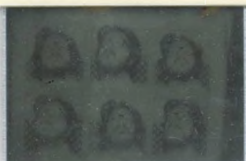
Matz, R.A. 1976 6 Multiple Mes Drawing 19"x23"