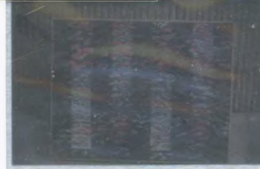
Matz, R.A. Sum 1978 The Great Pink up- rising Oil 53 1/2"x 43"