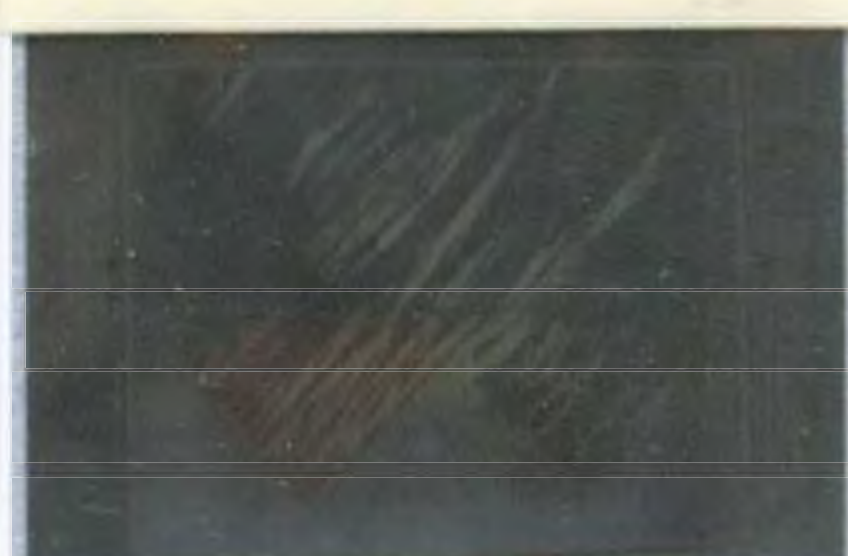
Matz, R.A. 1977 8 Rectangular X Scape Oil 53 1/2"x 43"