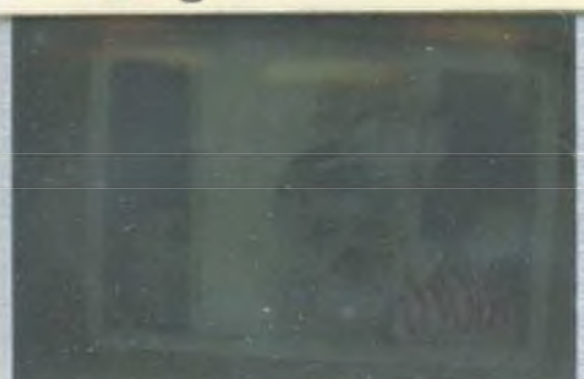
Matz, R.A. F. 1976 2 Defiance Drawing 15"x20"