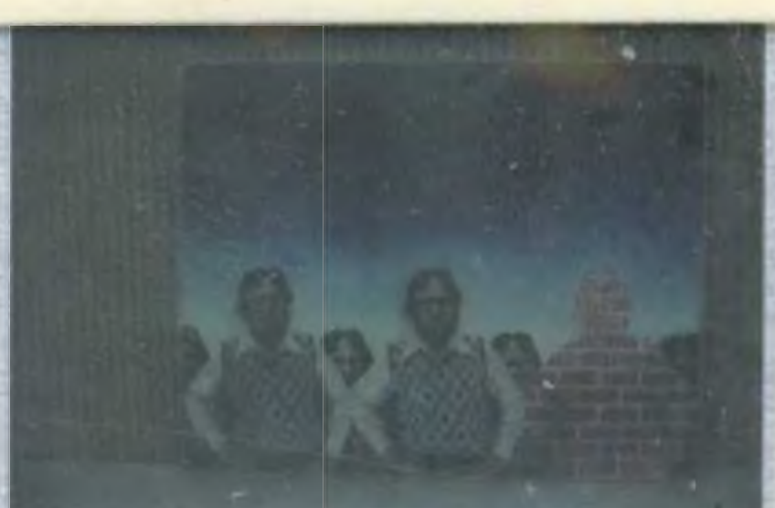
ing desire Oil 52"x72"