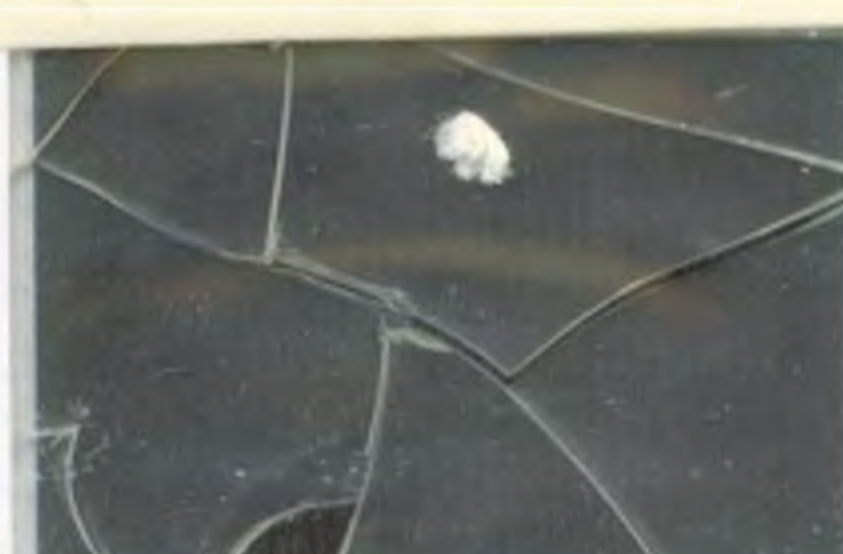
Matz, R.A. 1977 29 In-A-Row Oil 160"x47 1/2" 17