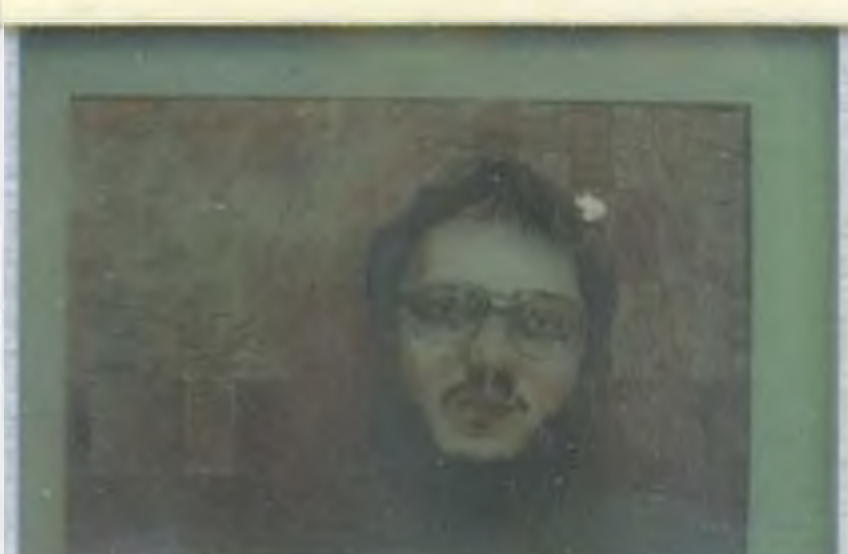
15"x 21 1/2