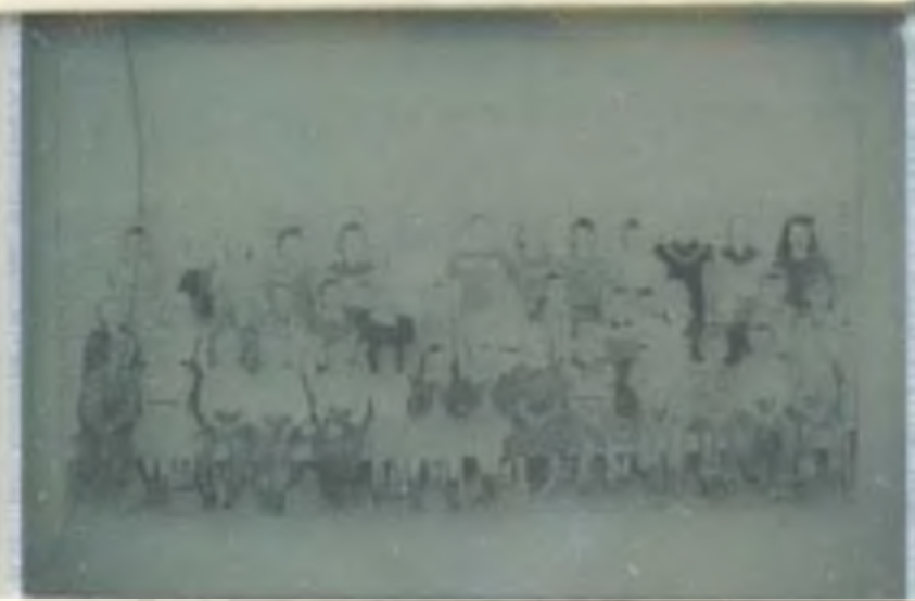
for the 4th grade Rectangular Imprint Drawing 35"x26"