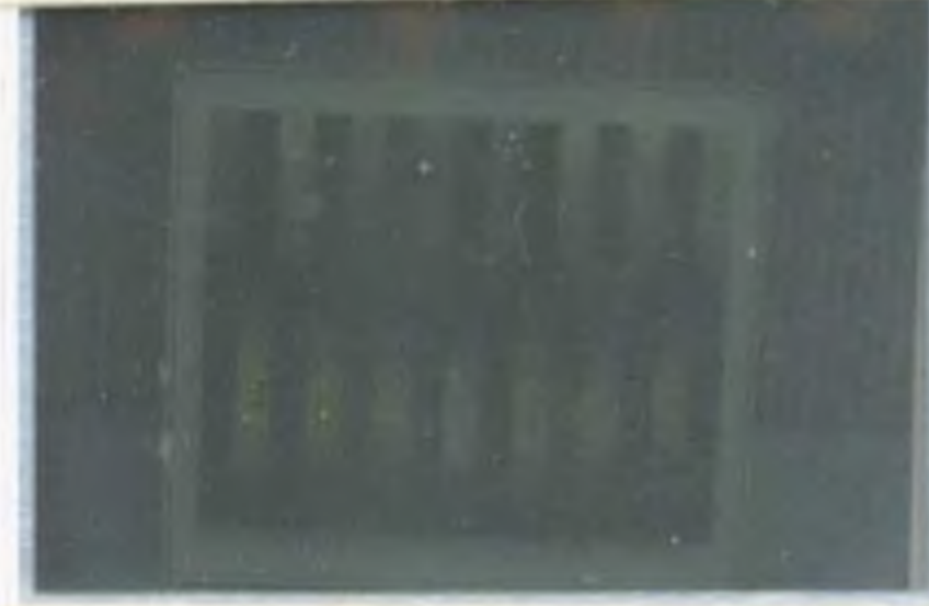
43 1/2"x 50"