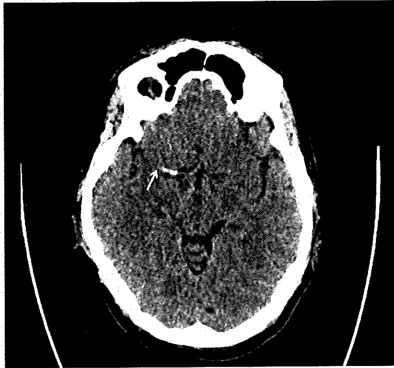
Figure 1. Initial CT scan demonstrating occlusion on right middle cerebral artery (arrow) 5

this syndrome may vary but typically include hemiparesis or hemiplegia of the limbs contralateral to the lesion. 4