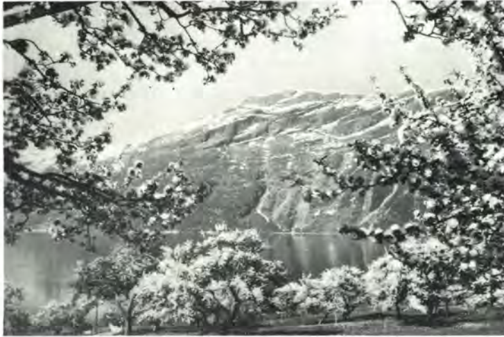
APPLE-BLOSSOM Time in Hardanger, Norway. Just one of the beautiful scenes that will be viewed by members of the UND Alumni on the European Tour slated for next May.