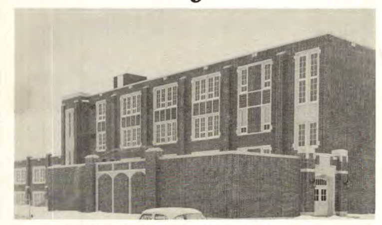
UND'S NEW CHEMISTRY BUILDING Ceremonies planned for April 27