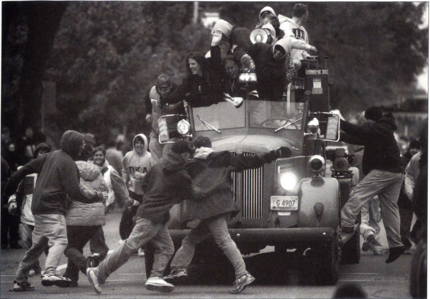
LET THE GOOD TIMES ROLL! Pi Kappa Alpha fraternity's distinctive fire truck rolls down University Avenue during the Homecoming parade (above). Meanwhile, a contestant learns that a tricycle race is much more challenging in practice than in theory (below). From warm autumn afternoons on the mall to winter sports and spring concerts, students find that the collegiate years are indeed an extraordinary period for learning, growing, and sharing good times with friends.