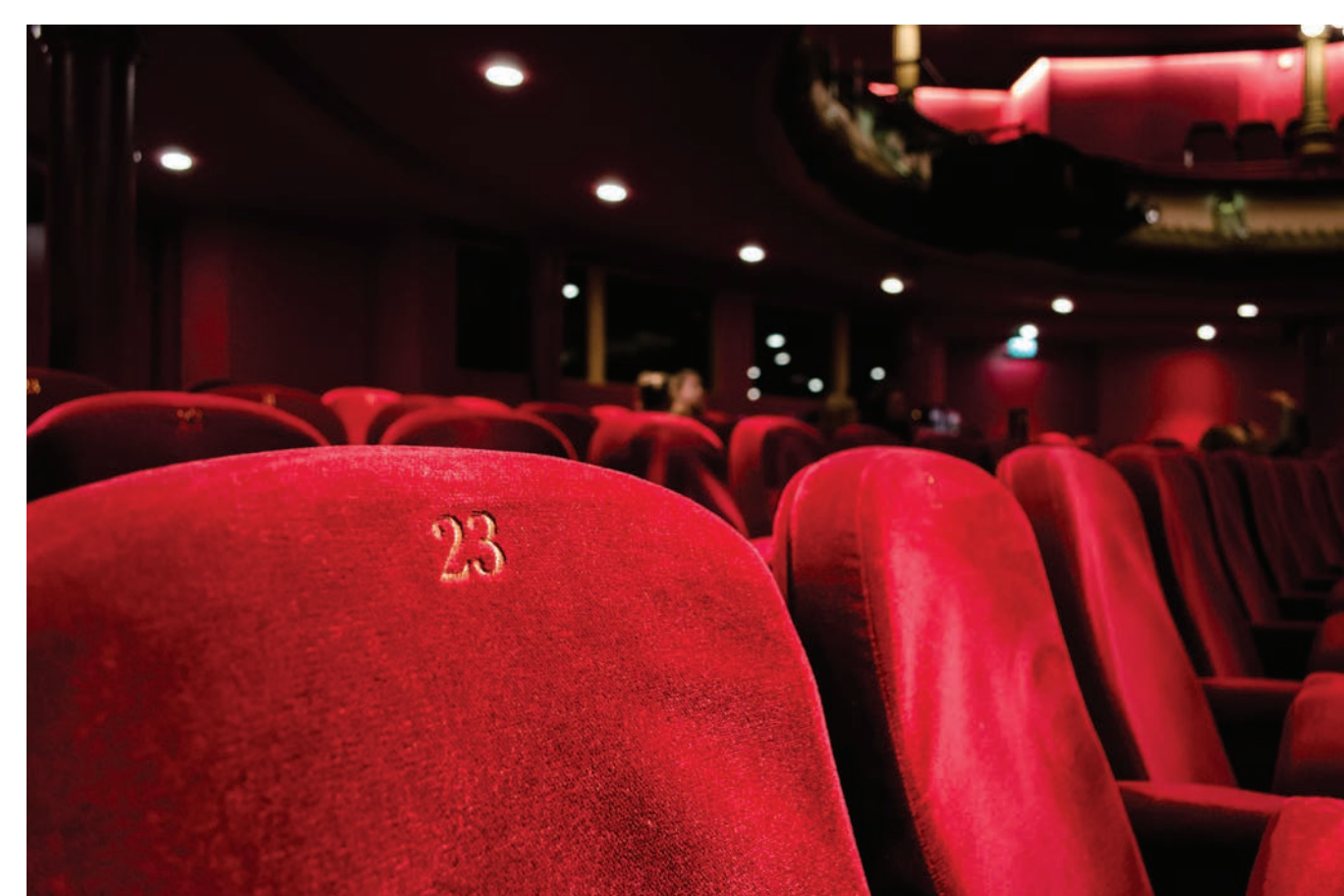
When was the last time you visited the movie theater?

each viewing. This is the genius of Damien Chazelle. He is able to tell a story that makes you not only feel something, but can make you feel something different each time. The final shot also links all of Chazelle's films. In all three of these films the final shot consists of the two main characters silently and knowingly staring into each oth-