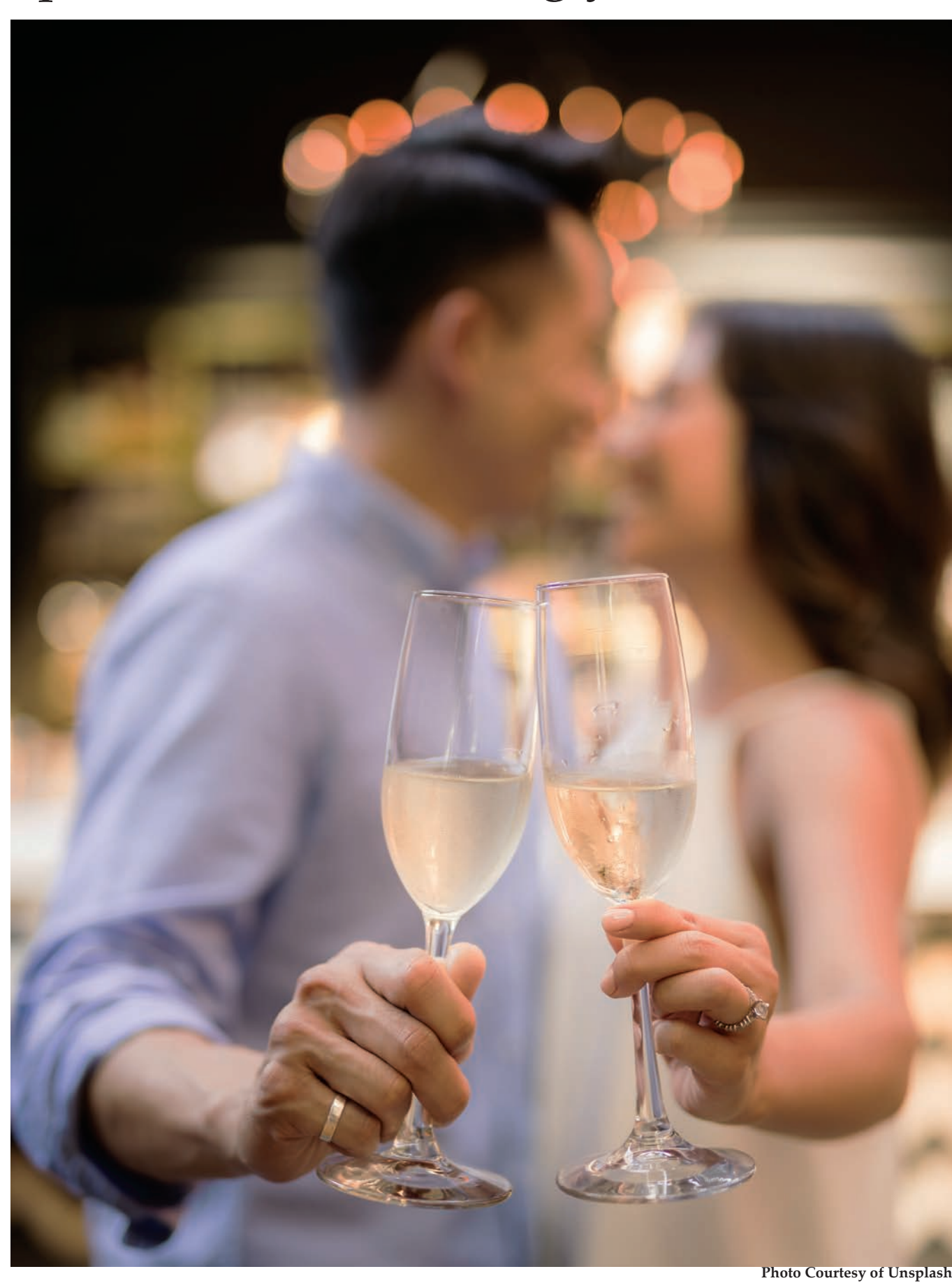
Try some of the restaurants around Grand Forks for Valentine's Day.