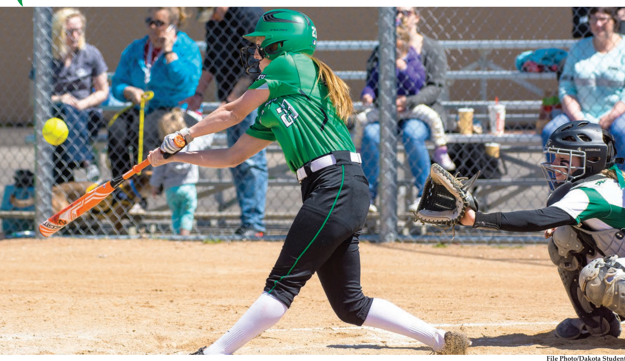
UND softball will be spending their season away with no home games on the schedule.