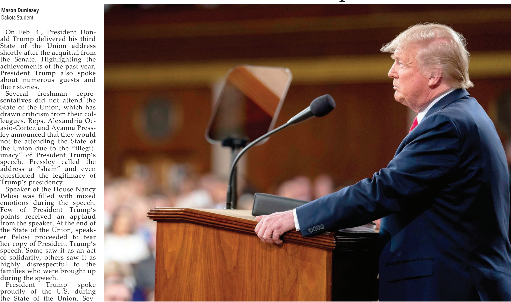
President Donald J. Trump taking the podium to deliver his address.

or, religion and creed very, very high. Since my election, we have created 7 million new jobs, 5 million more than government experts projected during the previous administra-