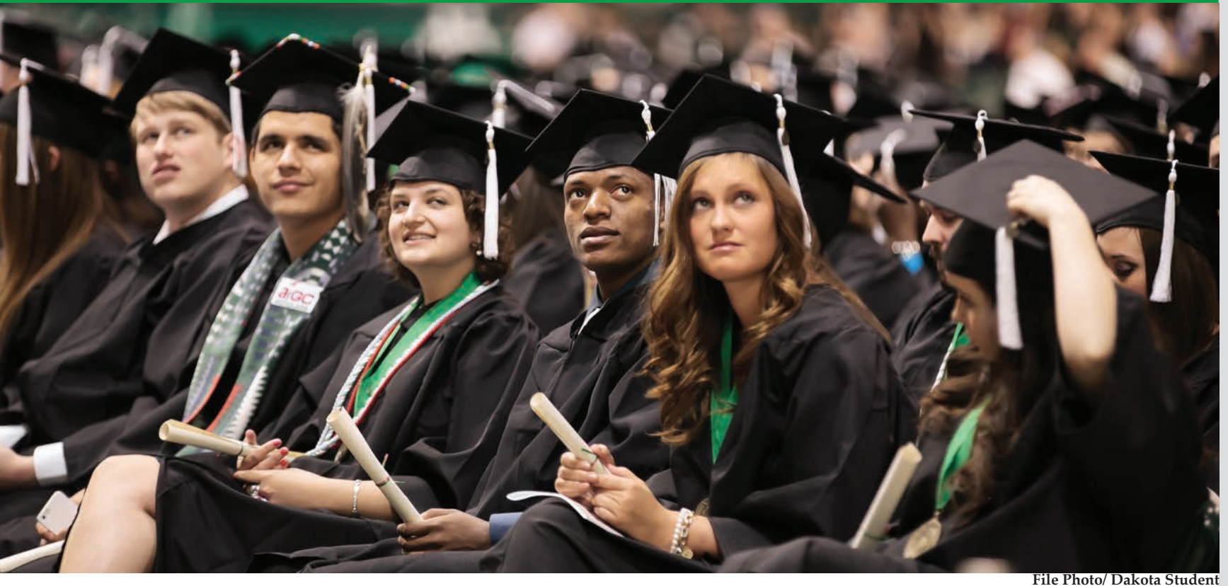
Scholarships can help alleviate the burden of tuition.