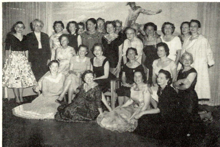
This picture is of a group of UND wives by adoption.