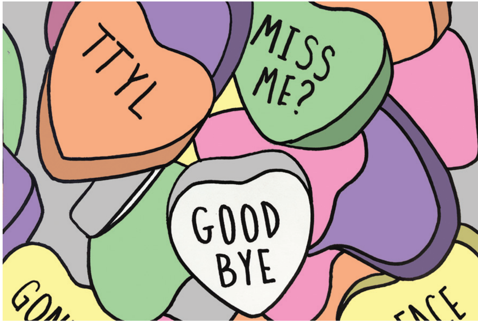
Sweethearts Conversations Hearts contain sentimental messages such as "Be Mine" or "XOXO."