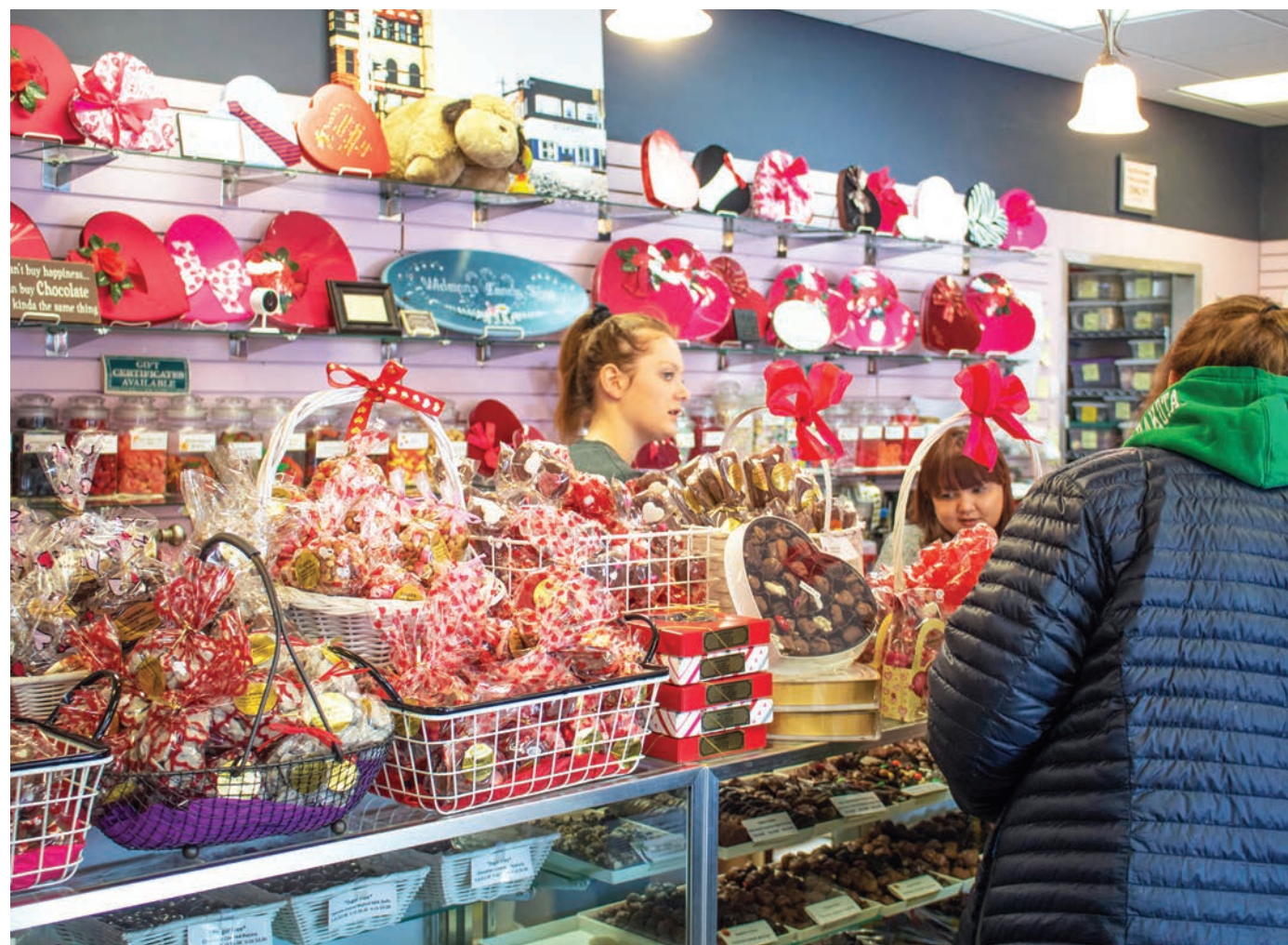
Widman's Candy Store in Downtown Grand Forks is very busy this time of year.

With the economy's prices increasing yearly, this concludes that the price of a simple, romantic gesture increases. Since 2017, there has been a significant price increase of nearly three dollars for a dozen, long-stem roses, totaling to about 50 dollars -