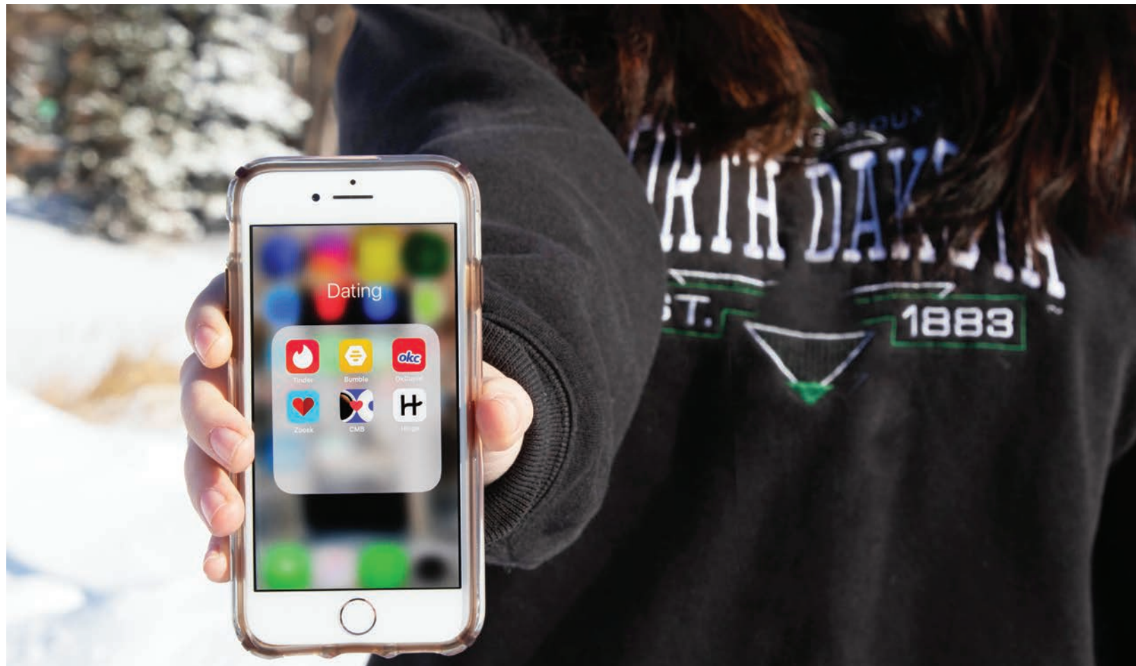
There is a wide variety of dating apps for all audiences.

North Dakota is ranked as the state with the lowest gender balance of singles, meaning there are more male or female singles than those who are male or female in committed relationships. North Dakota was also ranked with the fewest restaurants