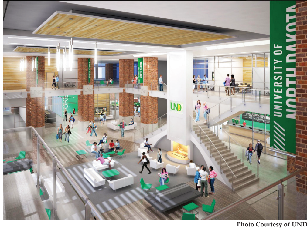
A look at what the new union will look like when it is completed.

for Dakota Student. He can be reached at quinn.robinsonduff@und.edu