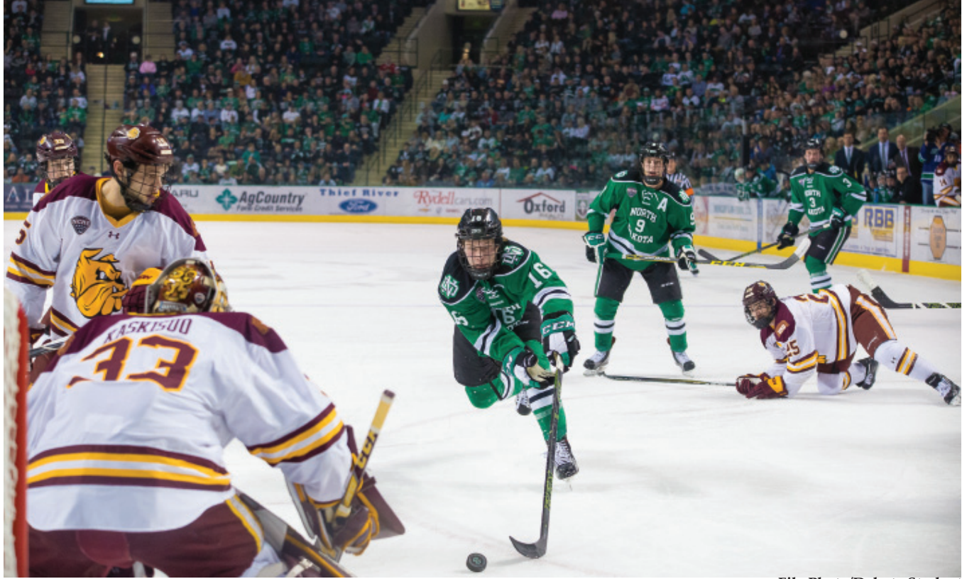
Duluth defense was not able to keep up with UND offense on Saturday night.