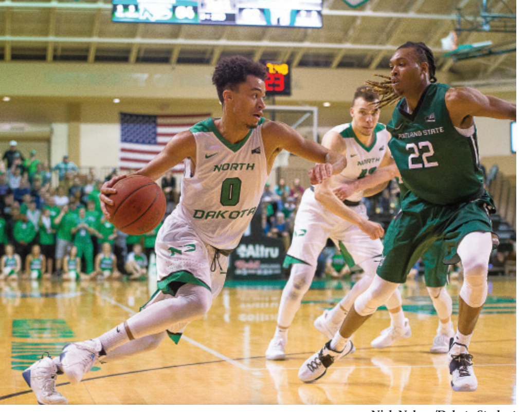
UND is still trying to find their rhythm after losing a couple key players last season.

Your major doesn't have to be your career. In our Post-Baccalaureate Nursing program, you can change it in just four semesters. Cohorts begin in St. Cloud in September and May, and in Duluth in