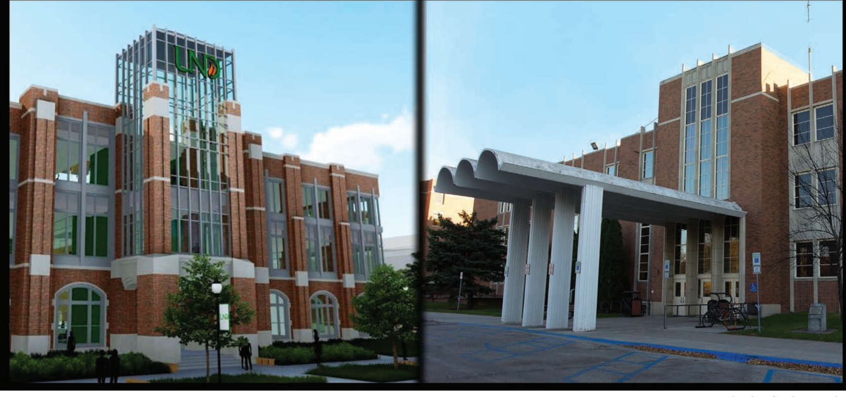
Students voted to make way for an improved Memorial Union.