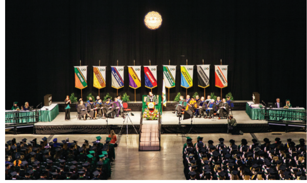
All areas of education are present during the graduation ceremony.

Bilal Suleiman is a columnist for Dakota Student. He can be reached at bilal.n.suleiman@und.edu