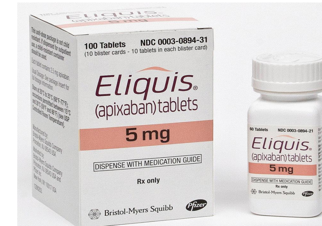
F.D.A. Clears Anticlotting Drug by Bristol and Pfizer (2012). The New York Times. Retrieved from https://www.nytimes.com/2012/12/29/business/fda-approves-eliquis-from-bristol-and-pfizer.html