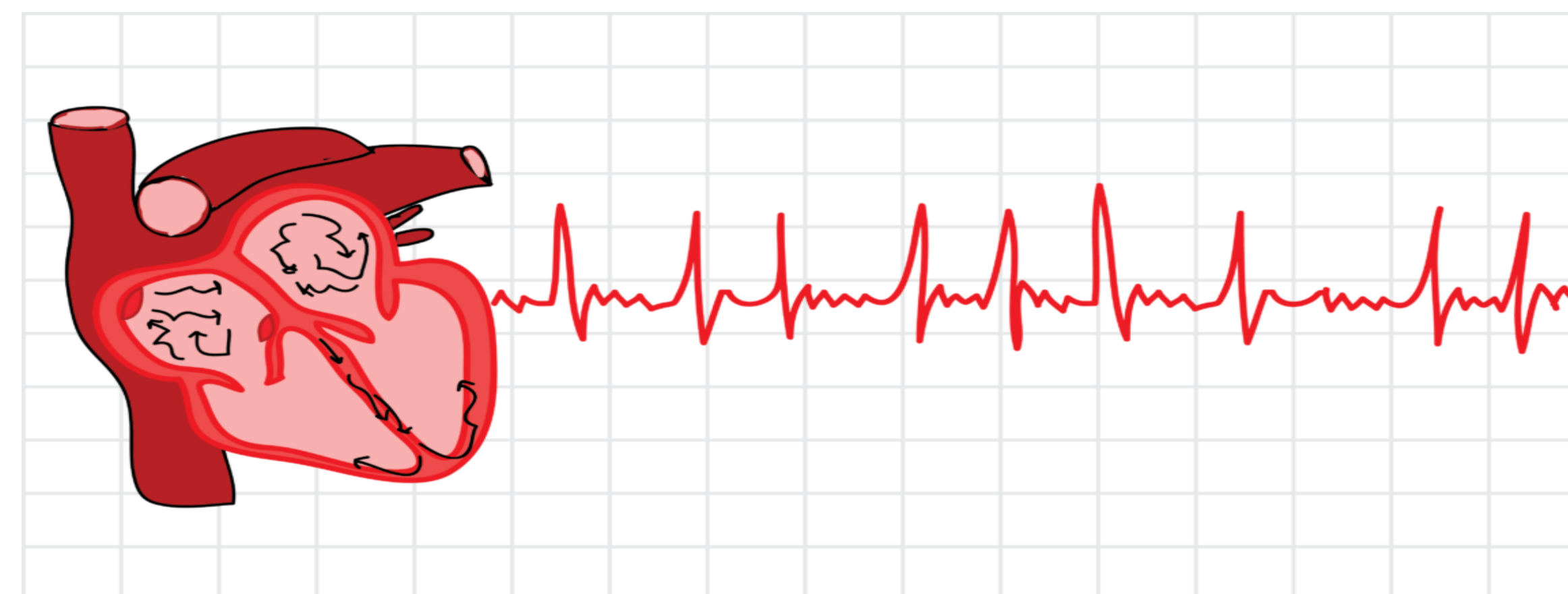
Understanding AFib: A heart dancing without rhythm. (2018). Scope Stanford Medicine. Retrieved from https://scopeblog.stanford.edu/2018/09/27/understanding-afib-a-heart-dancing-without-rhythm/