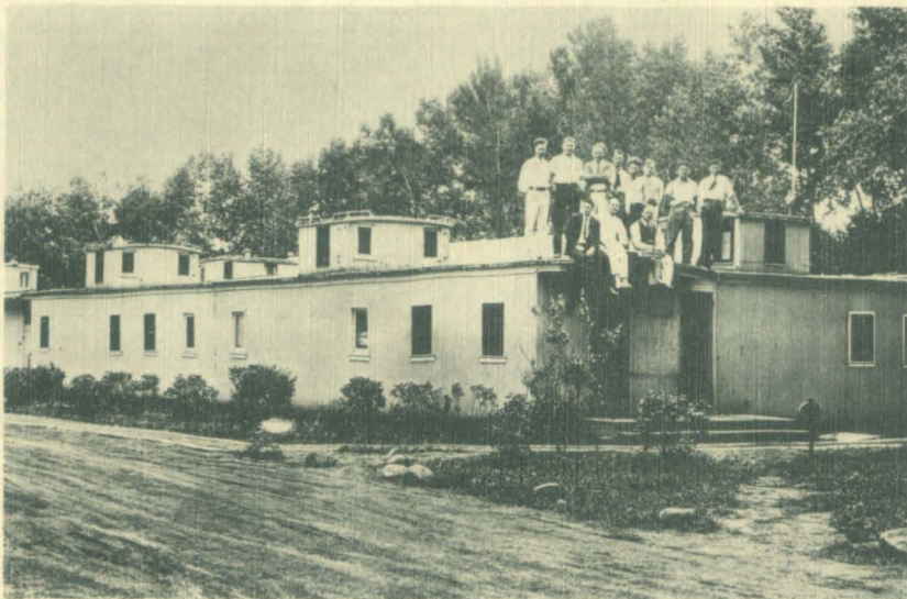
Set up in 1933, Camp Depression offered housing for 46 students at a time. They paid rent by working for the University four hours a week. Living rules were strict, and the students cooked their own meals. Townspeople frequently brought Sunday dinners for "the boys."

AFTER THE TURN OF THE CENTURY , state support resumed at adequate levels as the economy improved. Other hard times lay ahead: during the Great Depression, some 40 male students were housed in "Camp Depression," a cluster of 10 converted railroad cabooses set up on