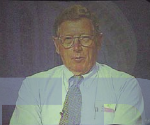
U.S. Senator Conrad Burns (R-MT)

Keynote speakers for the symposium included Senator Conrad Burns (R-MT), Senator Byron Dorgan (D-ND), and Rita Bajura, Director of the U.S. Department of Energy (DOE) National Energy Technology Laboratory (NETL). The 3-day symposium was organized and sponsored by the EERC, DOE, and EPRI.