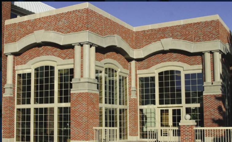
Southeast View of the New EERC Addition