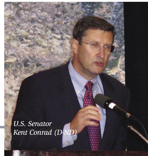
U.S. Senator Kent Conrad (D-ND)

Air Quality IV was sponsored by the EERC, DOE NETL, CATM through the EPA Office of Research and Development National Center for Environmental Research, and EPRI.