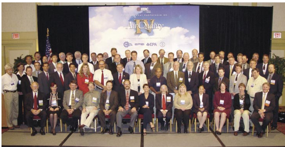
Chairs and Presenters at Air Quality IV

More than 350 people from more than 187 organizations, 40 states, and 10 countries attended Air Quality IV: Mercury, Trace Elements, and Particulate Matter on September 22–24, 2003, in Arlington, Virginia. Air Quality IV provided a forum for industry, government, and research organizations to help enhance the environmental performance of the nation's future energy infrastructure and meet the challenges of upcoming regulations for mercury emissions from coal- and oil-fired power plants. The two streams of technical presentations featured more than 70 presenters from around the world discussing air quality impacts on health and ecosystems. The conference also