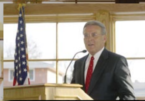
U.S. Senator Byron Dorgan (D-ND)

In addition to the meeting, a press conference led by Senator Dorgan discussed the impacts of Energy and Appropriations Bills for the EERC and North Dakota and the relationship to the Red River Valley Research Corridor; Senator Dorgan's position on interior appropriations; and the potential for future research.