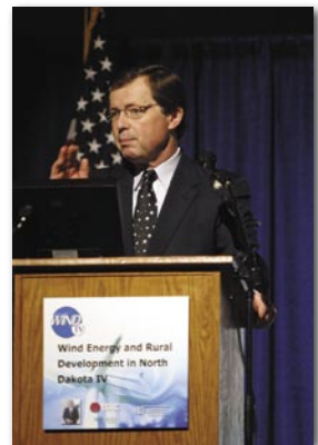
Representative Earl Pomeroy (D-ND)

More than 375 people from across the United States and Canada attended the Wind Energy and Rural Development in North Dakota IV Conference at the Bismarck Civic Center. For the second year in a row, the wind conference incorporated the Wind Energy Expo, which featured more than 40 manufacturers and organizations from across the country showcasing their products and services. At the conference, top industry leaders spoke on critical issues facing the wind industry in the state and nation. The conference allowed participants to see firsthand the exciting advancements in wind energy technologies and network with key industry leaders. The Wind Conference was sponsored by U.S. Senator Byron Dorgan (D-ND) in conjunction with the EERC and the North Dakota Department of Commerce Division of Community Services.