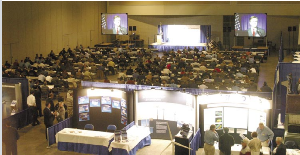
Wind IV Opening Session

More than 375 people from across the United States and Canada attended the Wind Energy and Rural Development in North Dakota IV Conference at the Bismarck Civic Center. For the second year in a row, the wind conference incorporated the Wind Energy Expo, which featured more than 40 manufacturers and organizations from across the country showcasing their products and services. At the conference, top industry leaders spoke on critical issues facing the wind industry in the state and nation. The conference allowed participants to see firsthand the exciting advancements in wind energy technologies and network with key industry leaders. The Wind Conference was sponsored by U.S. Senator Byron Dorgan (D-ND) in conjunction with the EERC and the North Dakota Department of Commerce Division of Community Services.