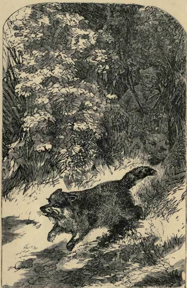
Univ Calif A RACCOON HUNT IN THE BUSH Digitized by Microsoft®