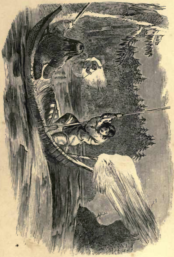
SPEARING FISH BY TORCHLIGHT.