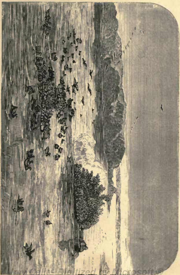
INDIAN DUCK SHOOTING.