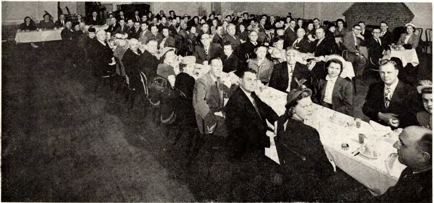
This picture was taken as the Bismarck-Mandan Alumni club met in Bismarck for the annual Founders Day dinner and meeting.