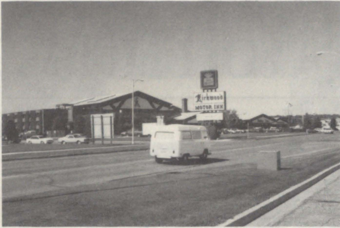
Reunion Headquarters, 800 South 3rd St., Bismarck