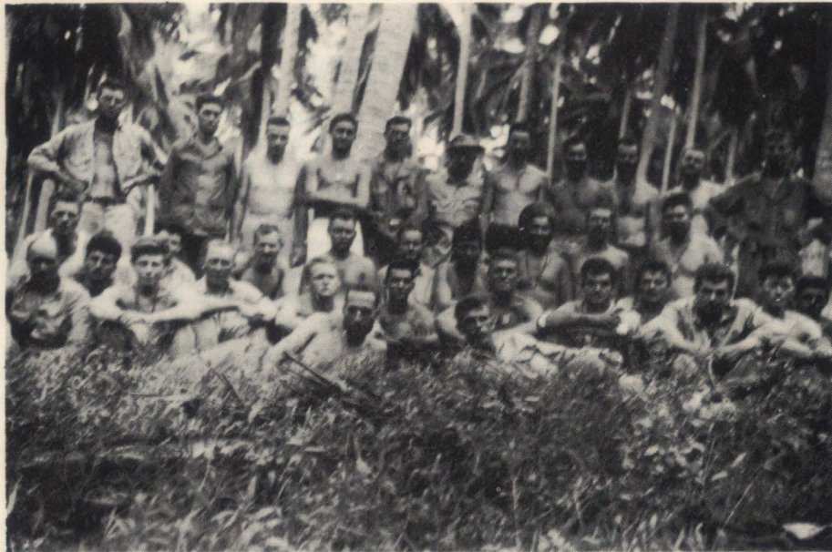
Picture is of the 2nd Platoon of H Co. 164th Infantry on Guadalcanal 1943.