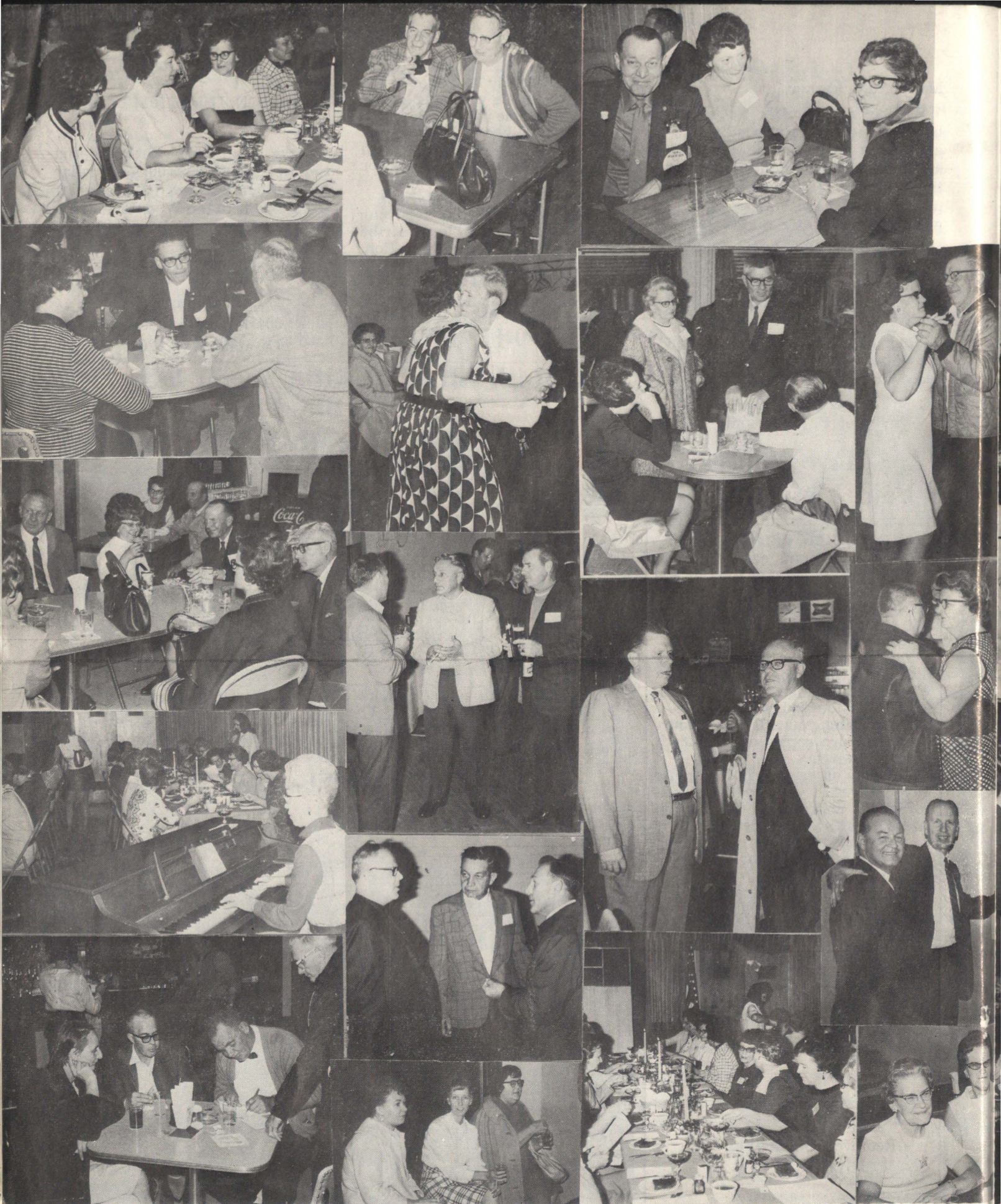
More Pictures Taken at 1969 Reunion