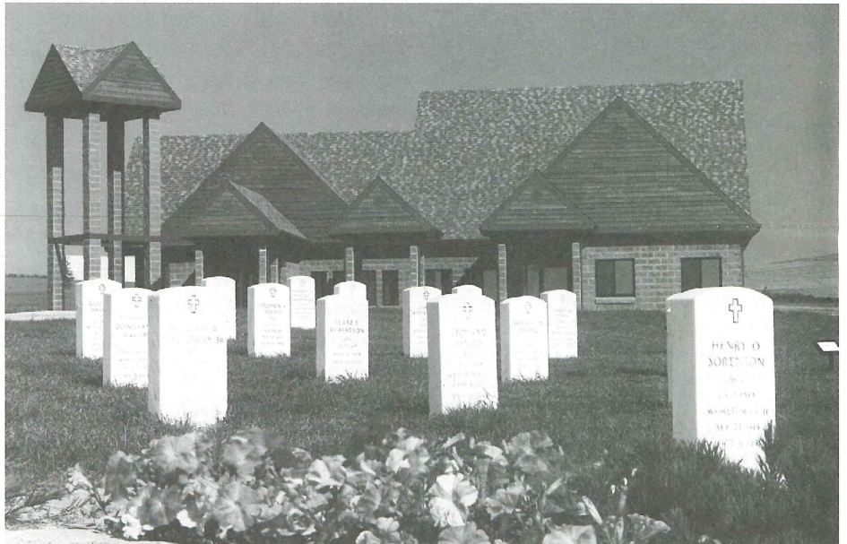
North Dakota Veterans Cemetery Headstones.

ALVIN TOLLEFSRUD PO BOX 256 MAYVILLE, ND