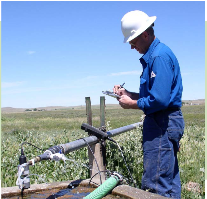
Figure 1. Water sampling at a CO 2 GS demonstration site.

Geologic storage (GS) is an evolving strategy being investigated for the long-term management of carbon dioxide (CO 2 ) emissions. A key component of CO 2 GS is the presence of cost-effective and efficient CO 2 monitoring, verification, and accounting (MVA) programs designed to demonstrate that each GS site is performing as anticipated, CO 2 is being sequestered, and water resources are being protected (Figure 1). The U.S. Department of Energy's (DOE's) Carbon Storage Program is researching, developing, and demonstrating a wide variety of the technologies for GS, including those needed for MVA. This fact sheet, developed by DOE's Water Working Group, focuses on the monitoring aspects of the MVA framework and provides an overview of the monitoring technologies that are being investigated for the protection of water resources.