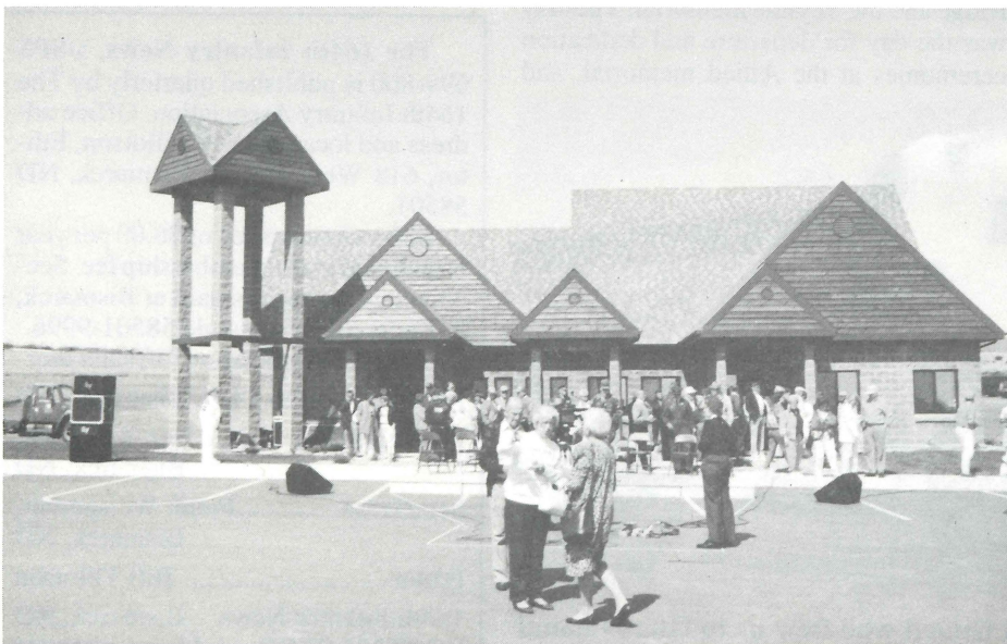
Chapel and Visitor Center. North Dakota Veterans Cemetery. The cemetery is located south of Mandan, North Dakota adjacent to Fort Abraham Lincoln State Park. This picture was taken at the dedication ceremony August 30, 1992.