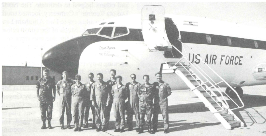
Crew from the Colorado Air National Guard who flew us to Guadalcanal and return. The aircraft is a modified Boeing 737. It was comfortably furnished and had equipment to prepare and serve excellent meals. The crews hospitality and professionalism made the trip one that was enjoyed by all.

We had a most enjoyable time. The meals prepared and served by the flight attendants were excellent. We enjoyed the informality of the crew. We had great rapport. A thrill of your editors life was sitting in the cockpit as we flew over San Francisco Bay.