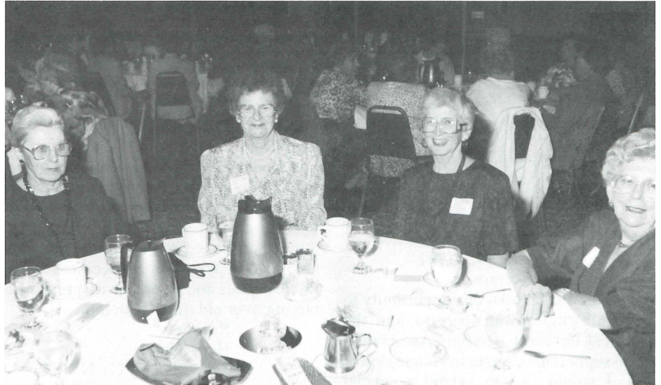
Ladies Luncheon, Fargo Reunion 1991