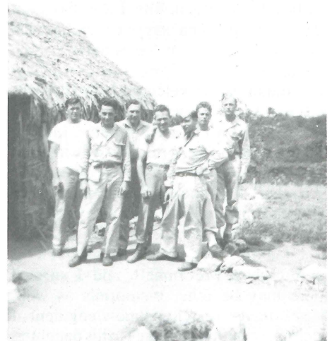
K Co. Group, Fiji, 1943.

The 164th Infantry News Box 1111 BISMARCK, N.D. 58502