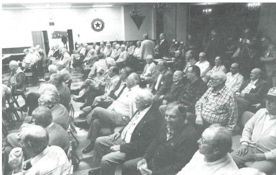
1991 Annual Meeting, Fargo, North Dakota