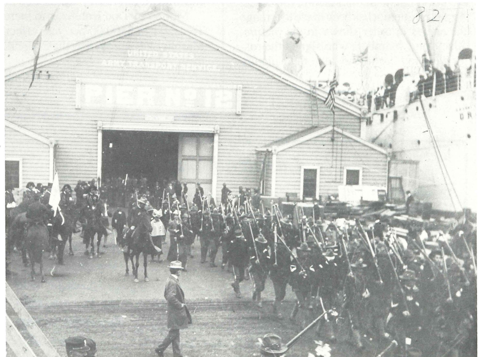
North Dakota National Guard embarks for Philippine Islands, 1898.