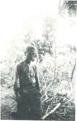
COL BRYANT E. MOORE SEPT 1942 to JUNE 1943