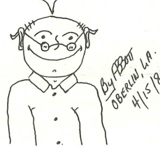
(* LIFT = TO DISAPPEAR, VANISH, TAKE-OFF!

NOTICE PLEASE This is your paper and it needs your support. It needs your stories, letters, and pictures to make it as good and readable as you desire. When sending in stories or photos of news interest, please identify all photos. Black and white glossy prints seem to reproduce best. Color prints may be used to a lesser degree of clarity if they are sharp photos. Photos used will be returned to sender when requested. Thank you respectfully, KEITH P. PARSONS Editor