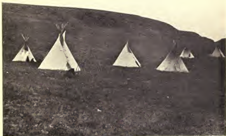
AT HOME IN THE WILDERNESS. A GROUP OF INDIAN TEEPEES.