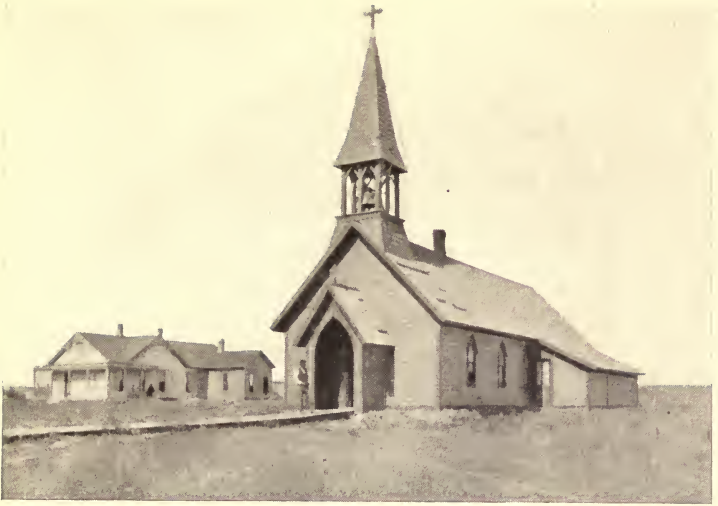
CHAPEL OF THE HOLY CROSS, PINE RIDGE AGENCY, USED AS HOSPITAL FOR WOUNDED INDIANS DURING THE "GHOST DANCE WAR."