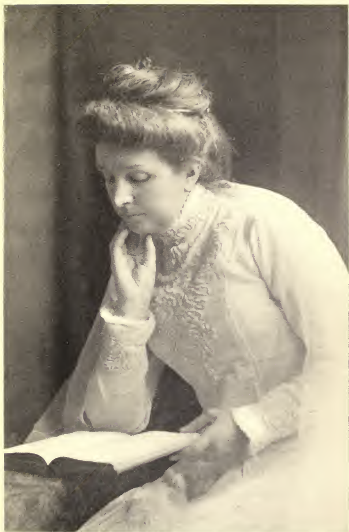
ELAINE GOODALE EASTMAN.