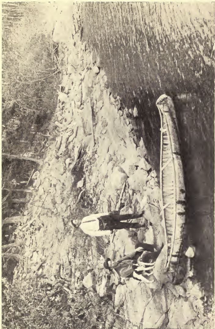
WITH GUIDE AND BARK CANOE, ON RAINY LAKE, ONTARIO.