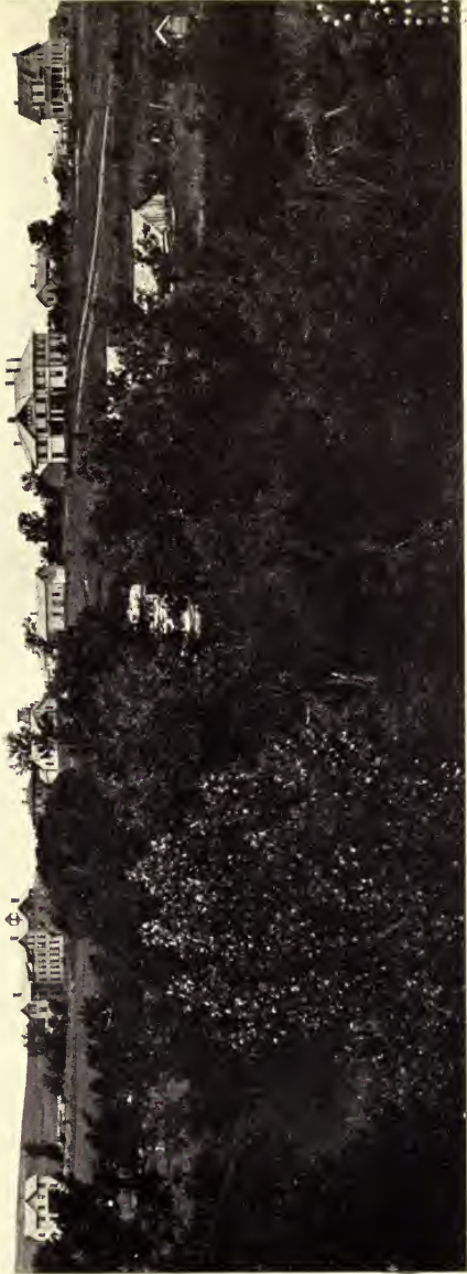
SANTEE NORMAL TRAINING SCHOOL, SANTEE, NEBRASKA, AS IT LOOKS TODAY. No. 1 IS THE OLD CHAPEL; No. 2, THE DAKOTA HOME.