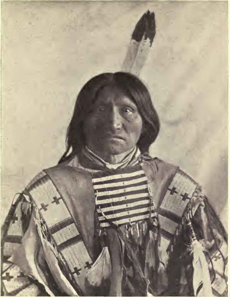
MATO-WA-NAHTAKA, (KICKING BEAR.) HIGH PRIEST OF THE "MESSIAH CRAZE," 1890-91.