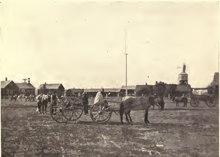
PINE RIDGE AGENCY, 1890.