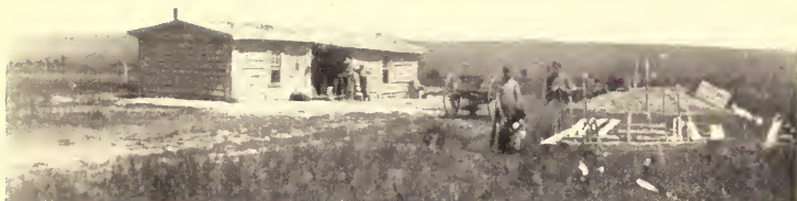
TYPICAL INDIAN LOG CABIN, SUCH AS DR. EASTMAN'S FATHER LIVED IN AT FLANDREAU, DAKOTA TERRITORY.