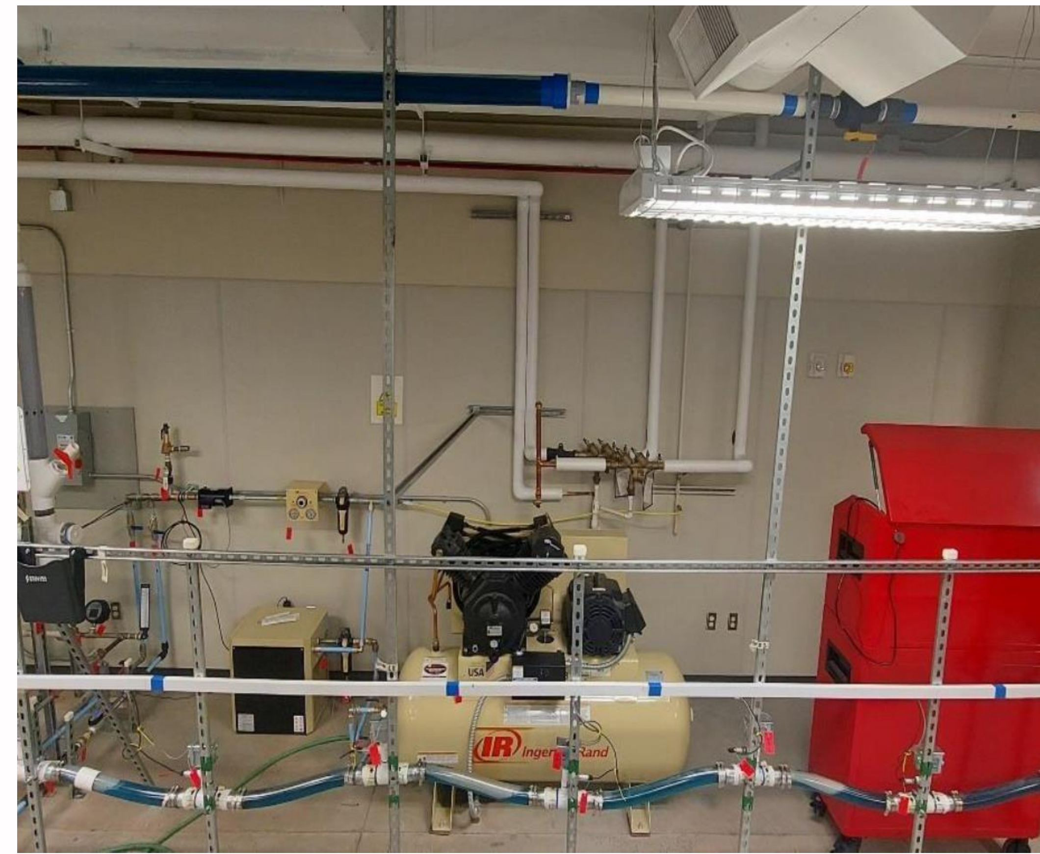
Fig 1. Photo of the experimental facility ( Khetib, Y, 2022)

To investigate and compare the predictive performance of different machine learning algorithms, including (but not limited to) decision trees, random forest and support vector machines for the given problem. To design a system that can utilize readily available operational data from gas wells, reducing the need for additional instrumentation or expensive data gathering processes.