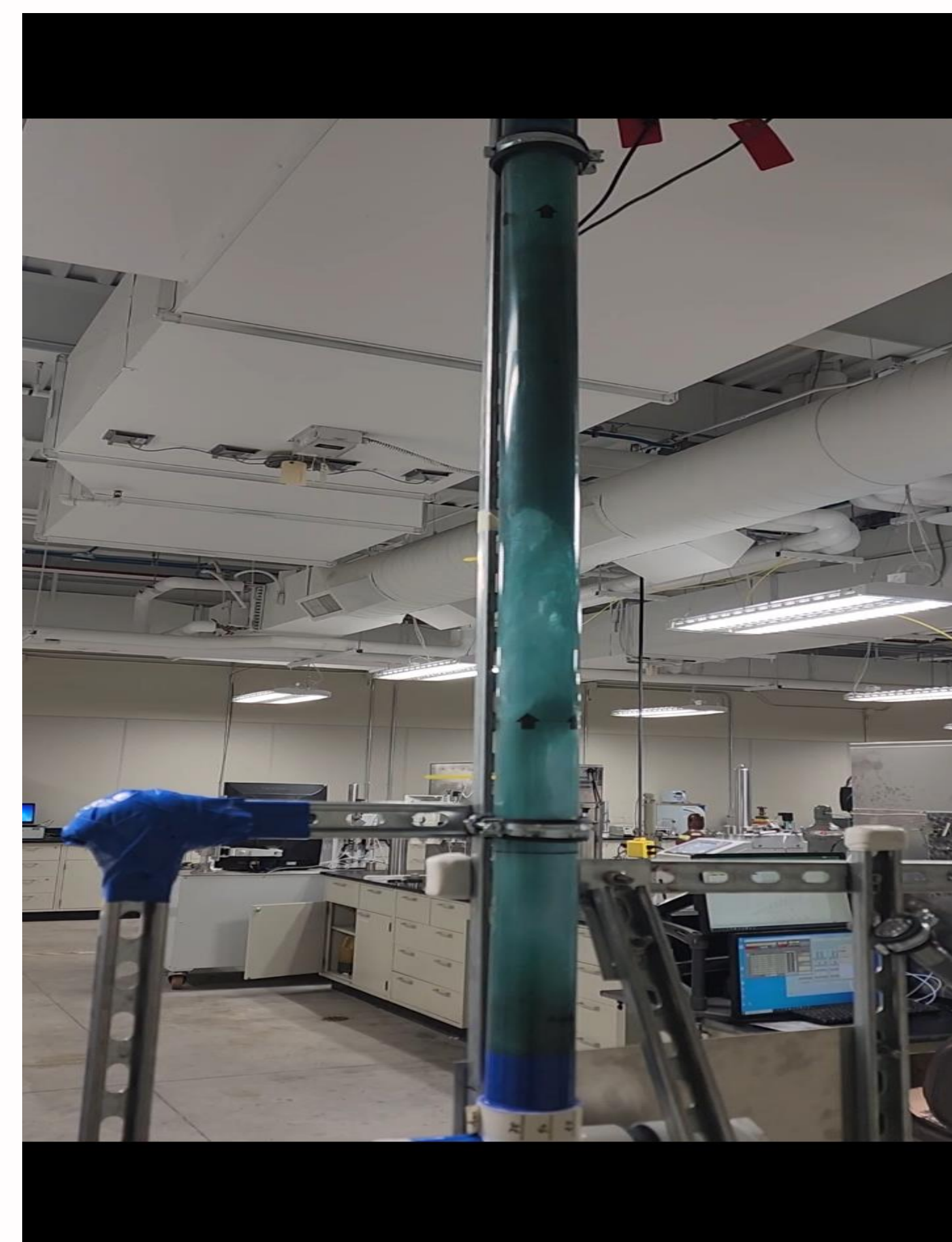
Fig 2. Illustration of the slug flow regime in a vertical tube