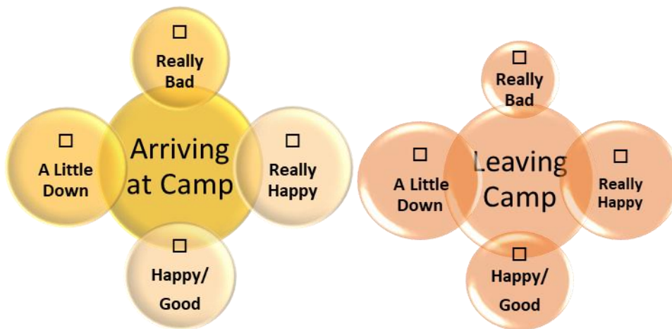
Figure 2. How did you feel when you got here? / How do you feel now?

With this, a basic drop-in card was created with direct input and participation from staff experienced in working with the local at-risk population, in addition to an experienced Indigenous evaluator with oversight by organizational Indigenous community board members and Elders. The tool was reviewed by a selection of regular camp clients to assess their usability and feasibility and adjustments were made based on those suggestions. The adapted and adjusted Likert scale terminology was chosen based on what was found to be the easiest to relate to for program participants (i.e., really bad, a little down, happy/good, really happy). These cards were filled out by those who did not come for a scheduled program or service, but instead as a cold-call visit to the camp. Basic demographic sections were created on the front of the card, such as name; whether this was a first or repeat visit to camp; preferred gender or other; and home community and referral agency if relevant. The backside of the card listed two visual colour-coded bubbles with four options for feelings (i.e., really bad, a little down, happy/good, really happy) for when the participant first arrived at the camp and then at the end before leaving the camp (see Figure 2).