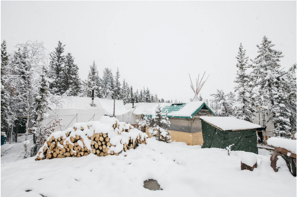
Figure 1. AIWF urban land-based healing camp, Yellowknife, NT, Canada

Programming is designed to be reflexive to user needs with a focus on developing cultural identity, self-esteem, agency, and the ability to cope with stress, in addition to fostering social support, as well as providing positive role models and a sense of community-belonging to participants. Specific activities provided to groups, individuals, or families include teachings and mentorship, support with traditional ceremonies, traditional food preparation, language revitalization, traditional tool making, on-the-land teachings, medicine teachings, sweat lodges, traditional Indigenous counselling, and cultural gatherings. Strength-based traditional Indigenous counselling and healing approaches focusing on resiliency are utilized following traditional local protocols. Camp users are rarely offered specific programs or services and do not have to make an appointment unless they specifically ask. Instead, camp users are supported where they are at, even if it is just to enjoy a quiet cup of bush tea by the open fire. This approach follows the modern description of trauma-informed and culturally safe practice, not explicitly defined in traditional Indigenous ways of healing, but inherent in its application by our ancestors.