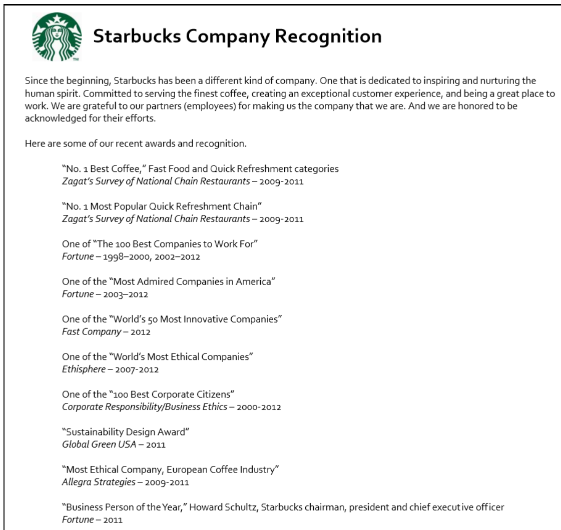
Exhibit 4 Starbucks company recognition